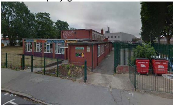
Existing Whitehorse Youth Centre

In addition, the area to the rear of the Youth Centre currently a childrens play area and this is of interest to On Side to enable additional outdoor facilities to be included within the offer. This is currently designated as Local Green Space and is used as a childrens play ground.