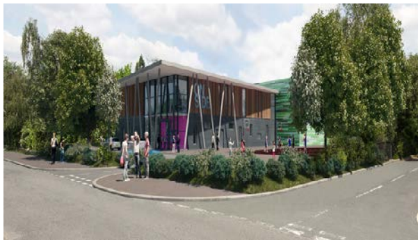
Proposed Barking and Dagenham Youth Zone

The existing youth building was constructed by the National Association of Boys Clubs in the early 1960's and is now dated and requires modernisation. The original lease granted to the Association was for 60 years and expires in March 2020. There are no break options other than if the site is required for highway improvements and therefore any early termination would need to be by agreement. The Council will support the existing owners in finding an appropriate alternative venue for the activities which would continue.