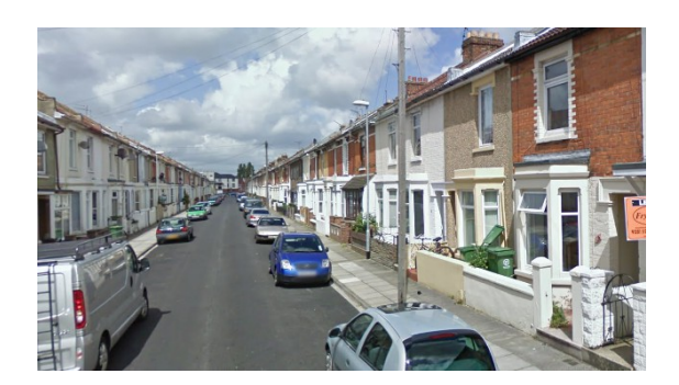
Example of a road included in the Portsmouth scheme

The Committee noted that officers from Portsmouth had advised that 20mph speed limits worked best in residential areas where roads could be described as being "beginning and end of journey" roads. The Committee heard that in Portsmouth it was considered that 20mph was an appropriate speed for the type and nature of these roads and that their experience showed that including main arterial roads in 20mph schemes initially at least is best avoided.