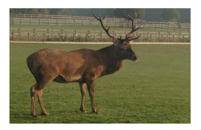
Park Hill - 'stag do' ends with move to new home

Normal service at Park Hill recreation ground was put on hold at the beginning of October when a red deer stag took residence, sparking a week of investigation into where he came from, and where he might go. The stag was ushered into the park after being spotted wandering along the adjacent railway lines. The fear he might have become aggressive prompted the decision to close the park, both to contain the stag and ensure his, and the public's, safety. There followed a week's negotiation and seeking of professional advice as officers looked into the best way to proceed, and to find the stag a secure new home. And, while those behind-the-scenes talks on his welfare were going on, staff ensured the stag remained undisturbed and had a supply of food and water. On the morning of Sunday 4 October, after 10 days in the park, the stag was tranquilised, loaded onto a trailer, and then, when he'd recovered