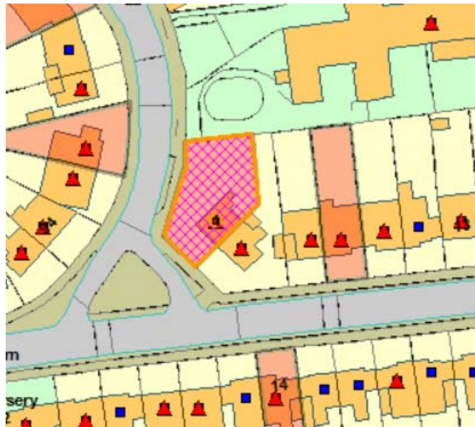
Figure 2: Site Location Plan