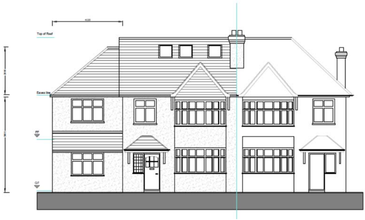
Figure 1: proposed front elevation