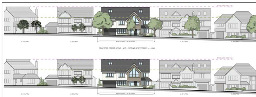
Figure 3 – street view image (bottom image shows street trees removed, noting this is not proposed but so the full extent of elevation can be seen)