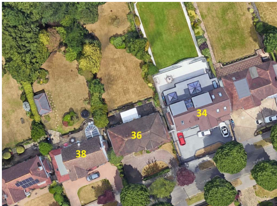
Figure 4 – aerial image showing dwelling and relationship to neighbouring properties

8.13 The site is flanked to the north-east by No. 34 Upfield, to the south-west by No. 38 Upfield and to the south-east by Nos. 51 and 53 Upfield.