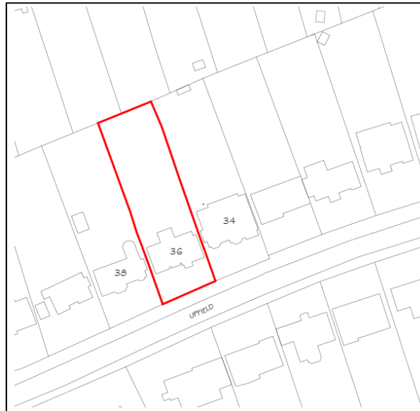
Figure 1: Site Location Plan