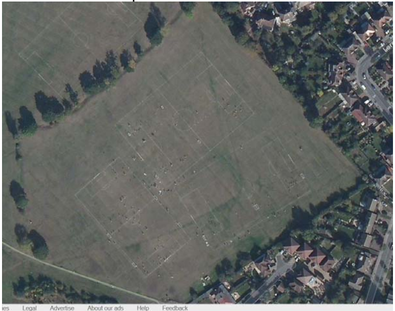
Image 5 – Birds Eye View of Relevant Part of Ashburton Playing Fields

4.10 The proposed development would be located in the south eastern corner of the Ashburton Playing Fields. The relevant parts of the site contains football pitches, trees, a pavilion and a footpath that links Woodville Avenue to Long Lane/ Ashburton Park. The development would be accessed from Woodville Avenue.