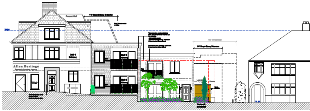
Proposed Elevation 2 scale 1:50