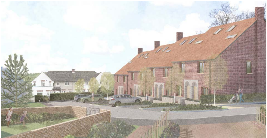
Image 6: Sketch of front elevation – facing onto Hawthorn Crescent