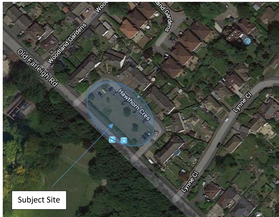
Image 2: Aerial view highlighting the proposed site within the surrounding area