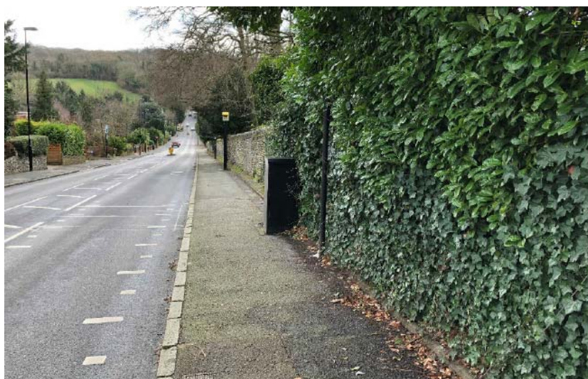
Image 8: View of locally listed flint wall – on opposite side of Old Farleigh Road

8.23 With regards to the air-raid shelter on the site, the heritage report stated that it typical of those built during the Second World War and are common. As such, the report concluded that it has no intrinsic historic or architectural interest to warrant consideration for listing or local listing. Council officers support this view, thereby accepting its loss.