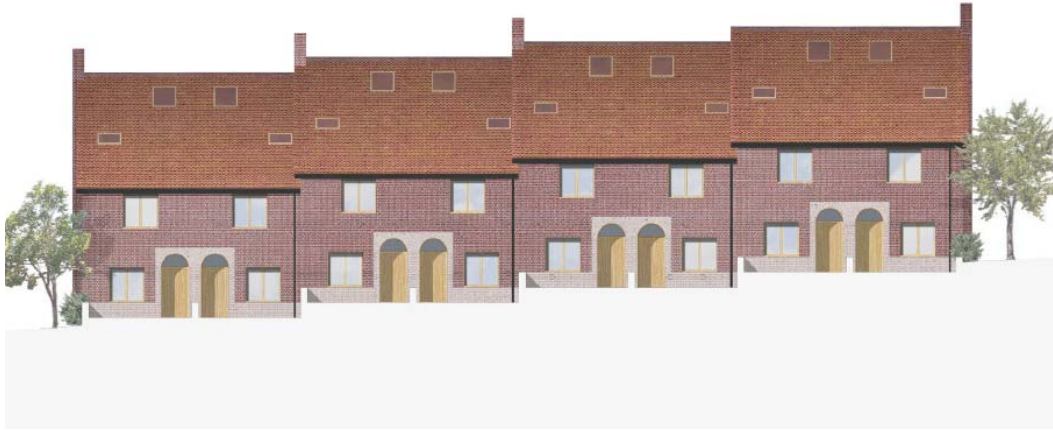
Image 5: Front elevation (two storey mass) facing onto Hawthorn Crescent properties