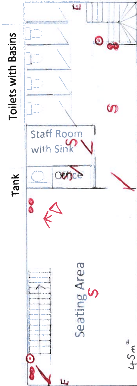
Basement Floor Plan Location - 28 George Street Croydon CR0 1PB