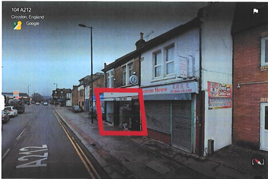
110-112 Whitehorse Road, Croydon.