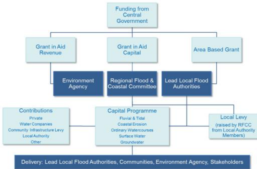
Figure 5: Summary of LLFA Funding streams

There are many ways in which central government funding can contribute towards local flood risk management, these are summarised in Figure 5 below.