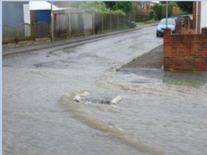
Figure 3: Surface water flowing onto Sites Hill Road Figure 4: Surcharging manhole on Caterham Drive

The sewer network in Caterham Drive is a separated sewer for foul water only. Surface water drains via a separate network of gullies and soakaways within the highway. A survey conducted by Thames Water following this event found that there was spare capacity within the foul network in this area, however, surface water entered the foul system resulting in overcapacity. The surface water may have entered the sewer network for a variety of reasons including direct surface water ingress into the foul water network and/or accumulated permitted and non-permitted connections over the years (Croydon, 2017).