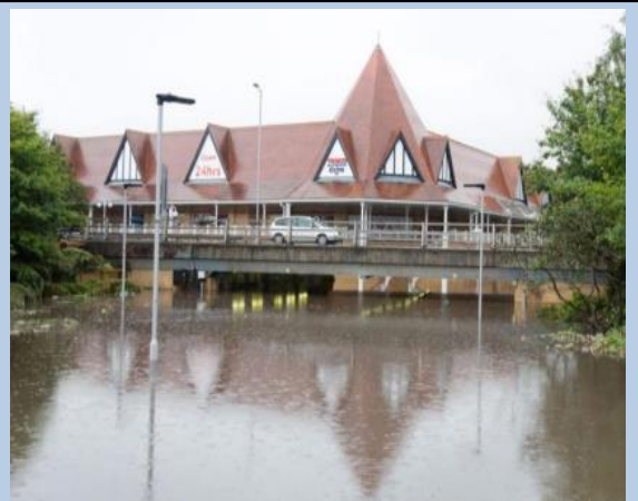
Figure 1: Purley Cross underpass (Croydon, 2015)

The deepest flooding was experienced in the pedestrian underpass beneath the roundabout (Figure 1), where it was reported to be approximately 1 foot (0.3m) below the underside of the bridge (2.7m clearance), an approximate depth of 2.4m. This flooding was reportedly exacerbated by failure of the pumping system in the underpass. Flooding was also reported on the surrounding road network, including the northern and western sections of the roundabout, causing travel disruption.