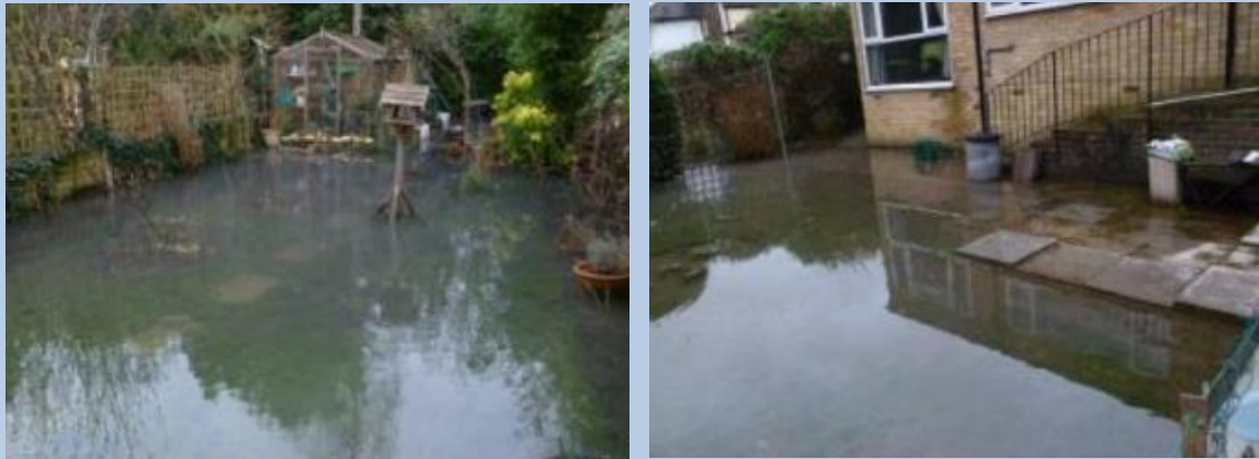
Figure 2: Flooded gardens during 2014 event (Croydon, 2015)

The Merstham Bourne, an ordinary watercourse near Coulsdon South Station, caused flooding to nearby residents' gardens in the winter of 2014. In January and February 2014, there was an increase of around 300% and 270% of the normal average rainfall for those months respectively. This event also caused disruptions to the nearby railway and nearby residents reported that lack of ditch and culvert maintenance led to the wider flooding of the area (Croydon, 2015). Specific details are outlined in the Merstham Bourne Flood Investigation Section 19 report.