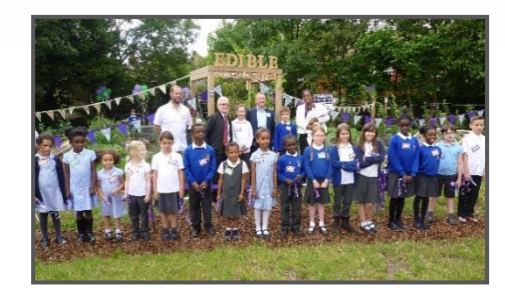
5 schools now have Edible Playgrounds

7 Food Flagship schools have supported staff from 48 other local schools to make improvements to their food provision and education