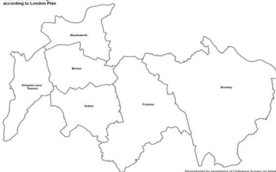
South London Boroughs according to London Plan