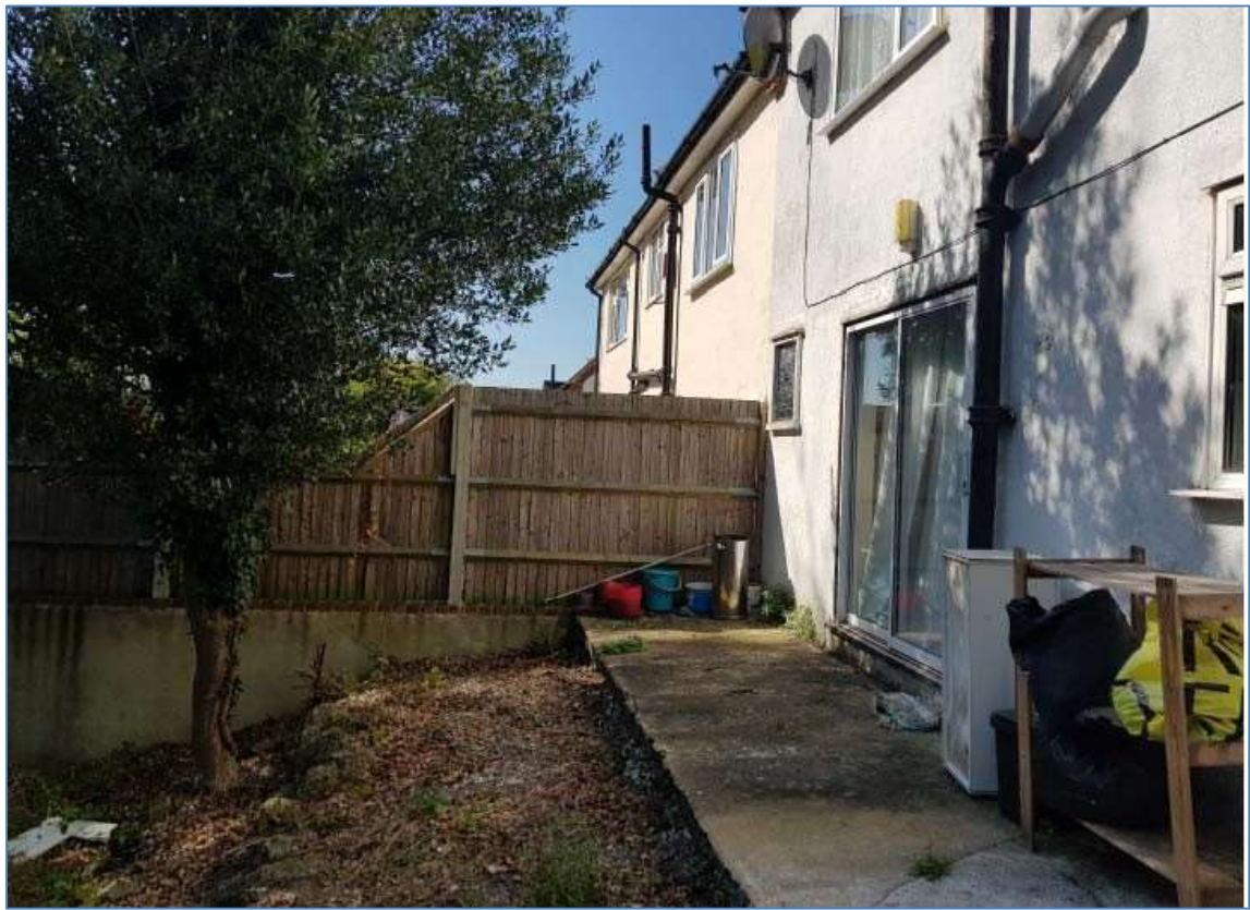
Figure 2: Side boundary with a high fence