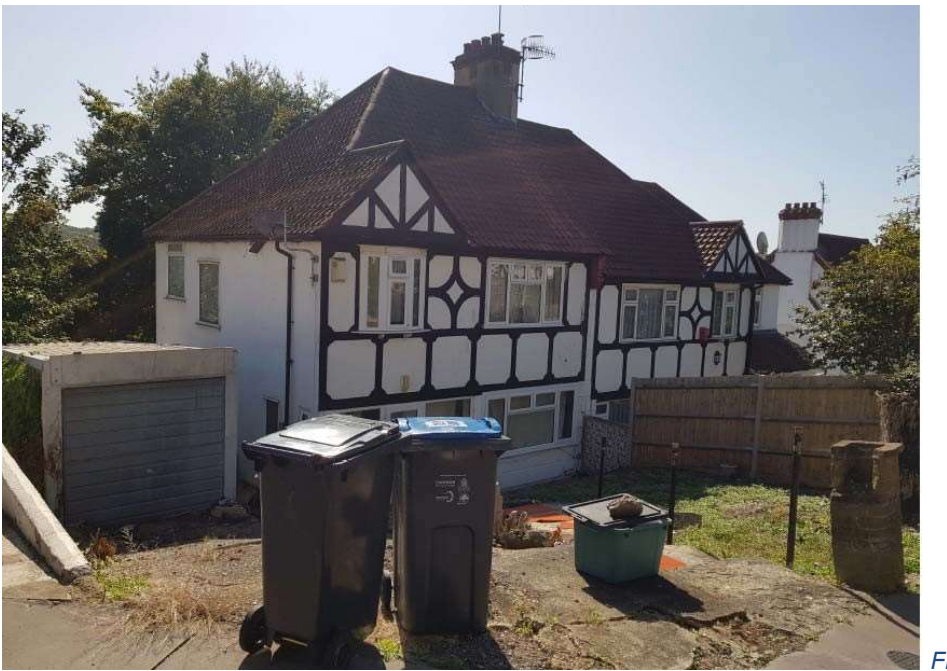
2 Existing house and garage

is used for parking cars. Therefore, it is considered that the loss of the garage is acceptable.