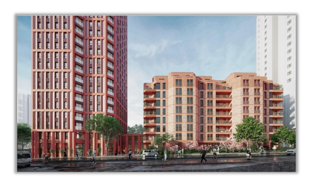
Image 14: CGI showing tower to left, mansion block centrally and Altitude 25 to right

6.19 The introduction of a second core to the linear block is a positive step and it is noted that the latest iteration now includes more dual aspect units, enhanced aspect units and the relocation of the family units to the lower levels of the shoulder and linear block.