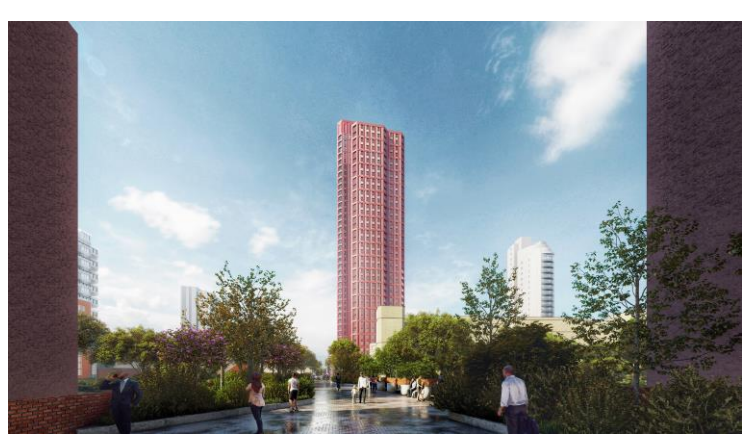
Images 12 and 13: CGI view from Altyre Road (I) and Hazledean Bridge (r)