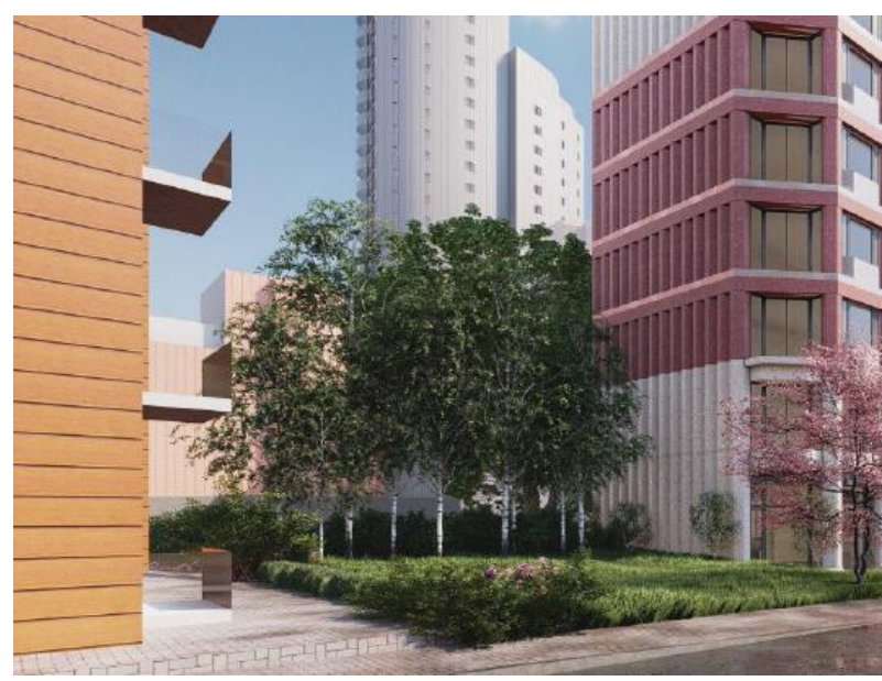
Image 17: New public square to Hazledean Road (example of amenity area to north-eastern corner) N.B the shoulder to the right has since increased in height since this image was produced

6.22 External communal amenity space will be provided in the central part of the site and on the roof of the 39 storey tower, with internal amenity provided on the 38<sup>th</sup> floor of the taller tower (linking to the external as shown in the image below). Given the build to rent typology, there would also be internal resident amenity at ground floor, with plans currently showing co-working spaces, gym/fitness centre, greenhouse/entertainment spaces, pet spa, children's play and community facility, as well as servicing facilities for the building. The initial indicative layout of these spaces are encouraging and seek to provide a wide offer for future occupiers.