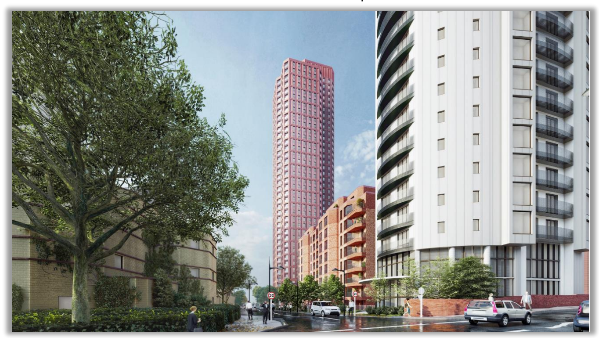
Image 19: Image depicting the relationship between the linear block and the tower

6.26 A public art strategy will need to be formed as part of any submission and the earlier that this is considered the more holistically it can be integrated with the architectural and landscape designs.