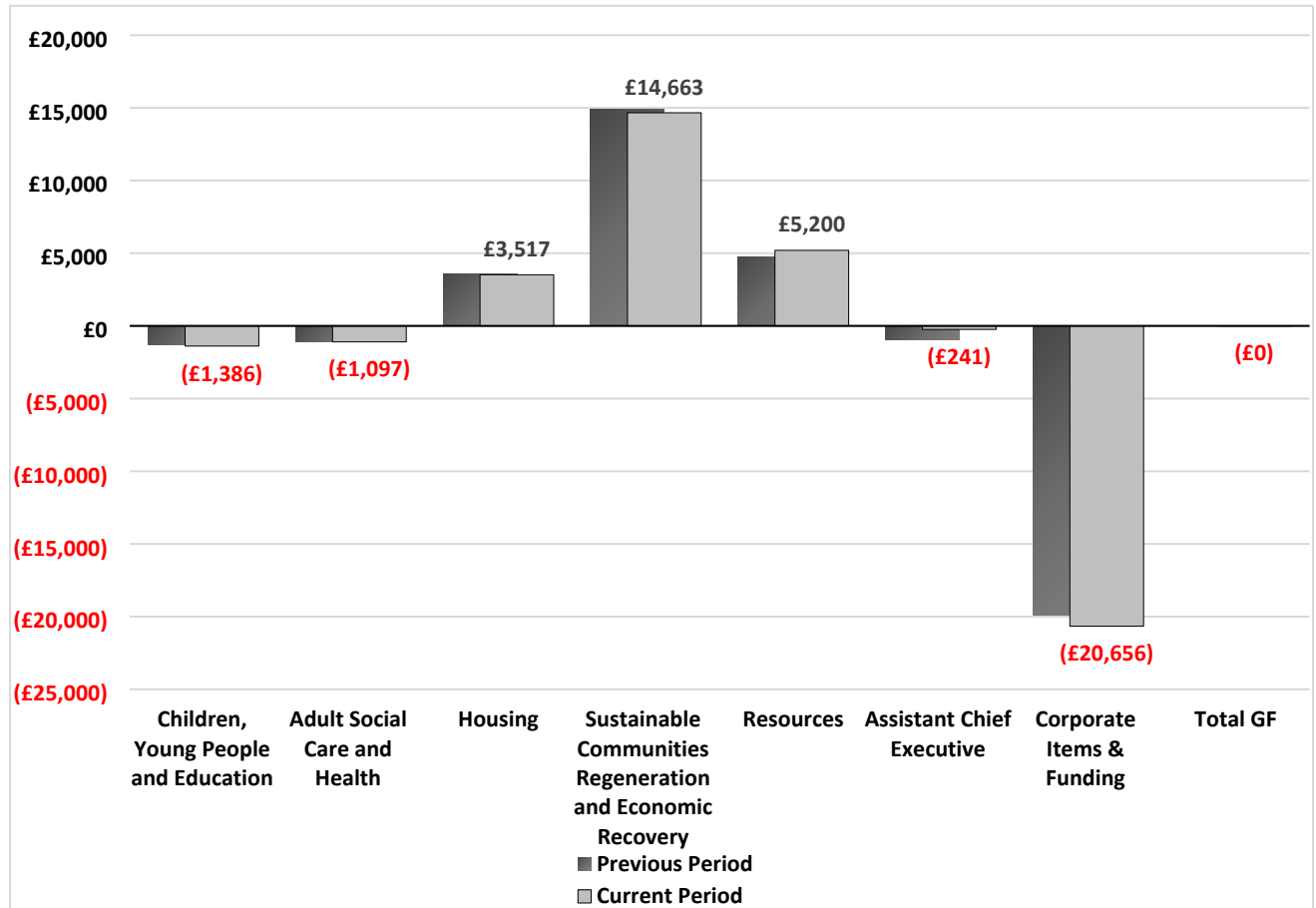
Chart 2: Forecast per Directorate as at Month 7

4.7. The chart below shows the forecast by Directorate for both the current and previous month: